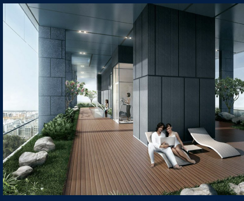
2 - Bedroom + Study Penthouse