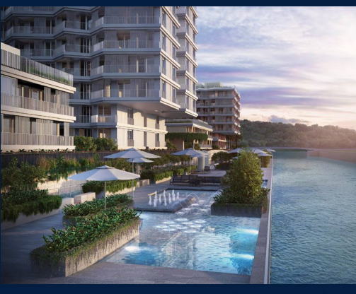
3 - Bedroom Premium