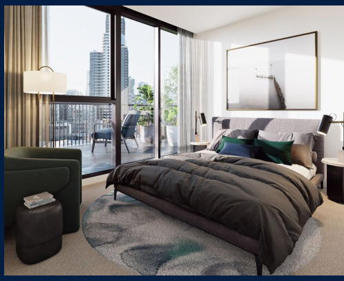
Roden: 3 - Bedroom